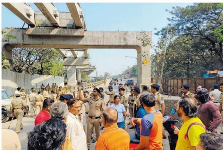
Police offer protection as state government officials had arrived to clean and clear the plot

'We strongly oppose the government's decision. We are not against the Dharavi Redevelopment Project, but developing this land will create infrastructural issues in Kurla East' Nilesh Kamble, A resident