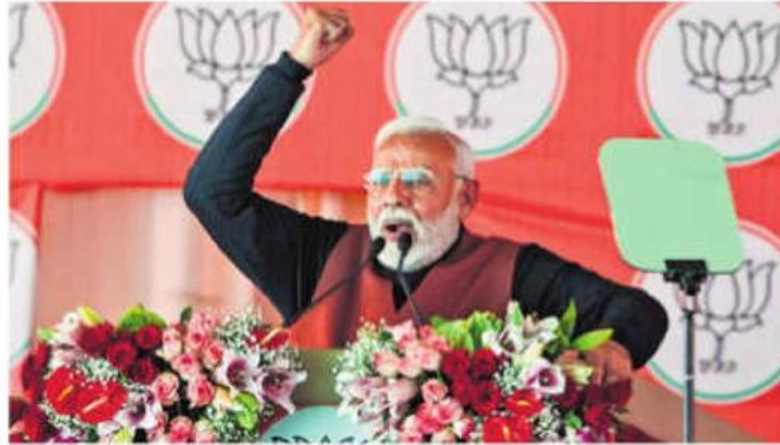
Prime Minister Narendra Modi during a public meeting in Rohini on Sunday

inaugurated a 2.8 km stretch of the Delhi Metro Phase-IV, connecting Janakpuri and Krishna Park. Valued at approximately ₹1,200 crore, this marks the first stretch of Delhi Metro Phase-IV to be launched. Key areas in West Delhi, including Krishna Park, parts of Vikaspuri, and Janakpuri, will benefit from this new connectivity. The Prime Minister also