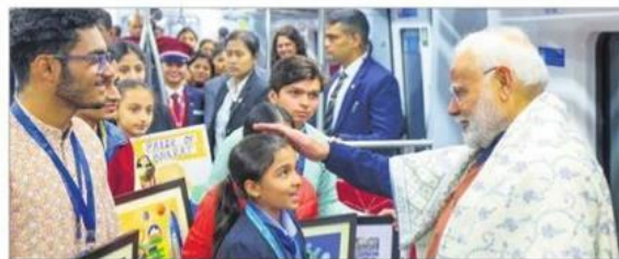
Prime Minister Narendra Modi interacts with passengers; (below) purchases a ticket to take a ride on the train during its inauguration.

The fare from New Ashok Nagar Station to Meerut South is Rs150 for standard coach