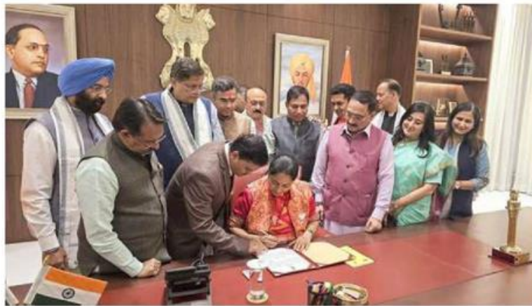
Taking charge: Rekha Gupta assuming charge as Delhi Chief Minister in the presence of senior BJP leaders at the Delhi Secretariat on Thursday.

Asked about the Bharatiya Janata Party's campaign promise of providing ₹2,500 a month to women, the Chief Minister said that it was discussed at the Cabinet meeting, but more