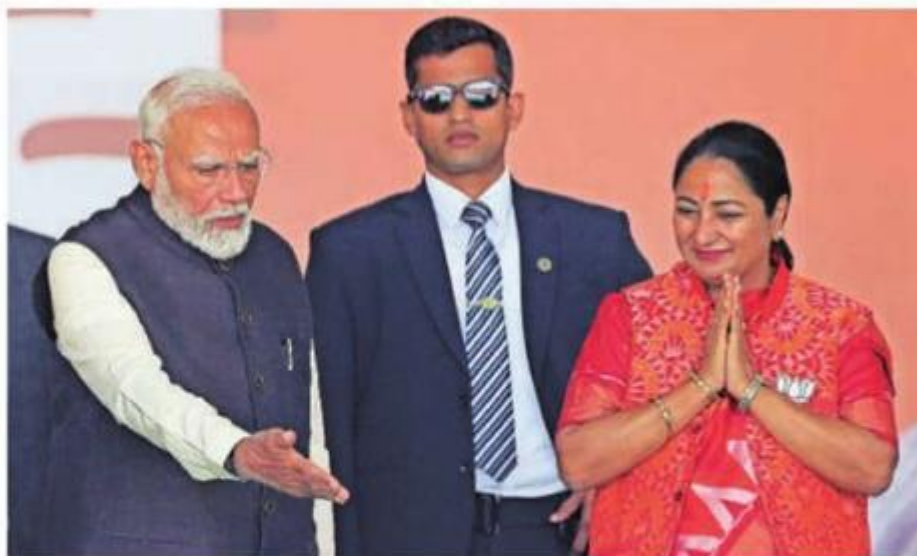
Prime Minister Narendra Modi with Delhi Chief Minister Rekha Gupta at the swearing-in ceremony in New Delhi on Thursday.

"The Cabinet discussed two major items on the agenda at the meeting today: Ayushman Bharat Yojana and 14 pending CAG reports. Prime Minister Narendra Modi gave this (Ayushman Bharat) scheme to the entire country but the previous AAP government did not implement it. But we passed it in our first Cabinet meeting," she said. "Under this scheme, the Central government will provide a benefit of Rs 5 lakh, and a top-up of an additional Rs