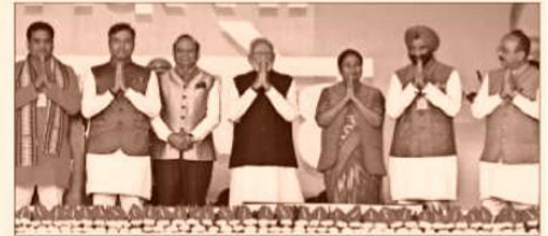
Prime Minister Narendra Modi, Lieutenant Governor VK Saxena, Rekha Gupta and BJP leaders greet supporters during the swearing-in ceremony on Thursday

On the new government's agenda for the first few weeks are announcements of a project regarding the cleaning and beautification of the Yamuna – giving women ₹2,500 per month starting March 8.