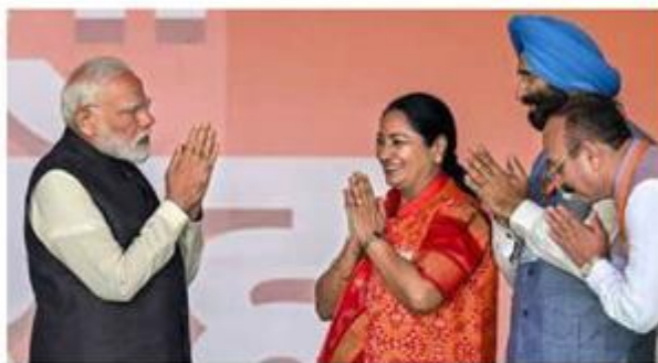
Narendra Modi with Rekha Gupta and other Ministers during the oath ceremony in Delhi on Thursday.