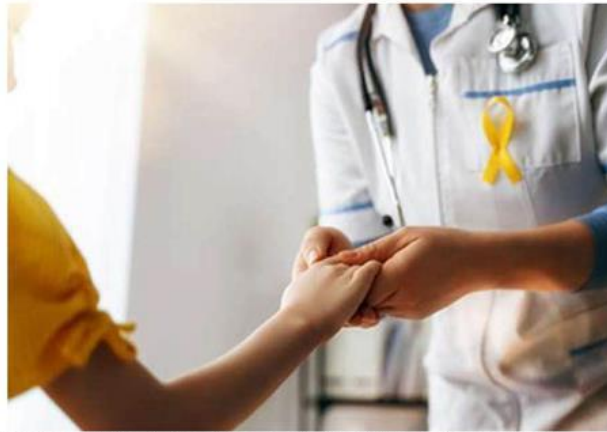
Loss of opportunity for education is just one example of the indirect costs of cancer treatment. Photograph used for representational purposes only

Protecting the next generation Children are the future of a nation. To build a strong nation, we need an educated and skilled workforce. Education is also a pathway to their economic empowerment. But cancer disrupts this journey.