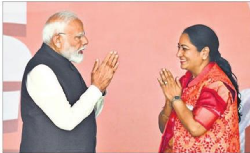
Prime Minister Narendra Modi greets the newly elected Delhi chief minister Rekha Gupta during her swearing-in ceremony at Ramlila Maidan on Thursday.

The CM chaired the meeting of the first cabinet on Thursday evening at Delhi secretariat. The cabinet considered and