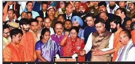
नवनिर्वात सीएम रेखा गुप्ता वीरवार शाम मंत्रियों के साथ वासुदेव घाट पर यमुना की पूजा-आरती में शामिल हुईं।

शपथ लेने के बाद रेखा गुप्ता मंत्रियों के साथ वासुदेव घाट पहुंचीं और यमुना की आरती में शामिल हुईं। 26 साल बाद दिल्ली में भाजपा की सरकार बनी है। इस ऐतिहासिक पल का साक्षी बनने के लिए पीएम नरेंद्र मोदी, रक्षा मंत्री राजनाथ सिंह, गृह मंत्री अमित शाह समेत एनडीए शासित 21 राज्यों के मुख्यमंत्री, उपमुख्यमंत्री व अन्य नेता मौजूद थे। व्यूरो