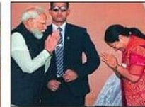
पीएम मोदी का अभिवादन करती रेखा गुप्ता।

रेखा गुप्ता ने कहा-विकसित दिल्ली की राह में एक दिन भी बर्बाद नहीं करेंगे सीएम रेखा गुप्ता ने कार्यभार संभालने के बाद कहा कि विकसित दिल्ली मिशन को पूरा करने की राह में एक दिन भी बर्बाद नहीं किया जाएगा। जनता से चुनाव में जो भी वादे किए हैं, सभी पूरे किए जाएंगे।