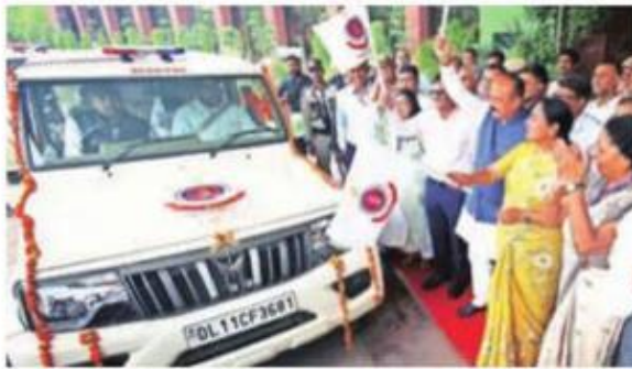
Delhi Chief Minister Rekha Gupta flags off a Forensic Science Laboratory vehicle in New Delhi on Friday.