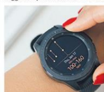
AI-powered calorie tracking apps are already in use

AI can help by reminding clients to take their medications, schedule therapy sessions or engage in mindfulness exercises. It can also provide basic emotional support and analyse input to determine areas that need work.