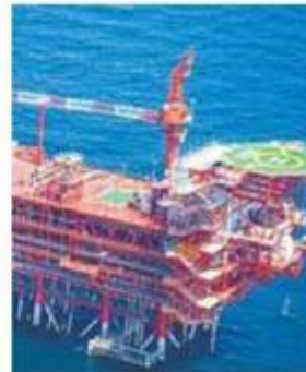
A single judge of the Delhi High Court, on May 9, 2023, dismissed the GoI's appeal challenging the arbitral award

"Consequent upon the above-mentioned Division Bench judgment, the MoPNG has raised a demand of $2.81 billion on the pro-