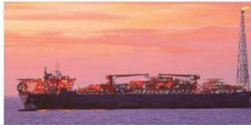
ONGC had argued that at least four wells that Reliance Industries drilled in its KG-D6 block drew natural gas from the neighbouring block.

In 2016, the government had raised a demand of $1.55 billion on RIL and its partners for sale of gas that allegedly migrated from ONGC's block. RIL took the case to an international arbitral tribunal, which ruled in its favour in 2018. Five years later, in 2023, the government appealed the arbitral award before the Delhi HC. While at first a single judge ruling of the court upheld the arbitral award, upon appeal, the Division Bench set aside that order and ruled in favour of the government.