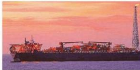
ONGC had argued that at least four wells that Reliance Industries drilled in its KG-D6 block drew natural gas from the neighbouring block.

In 2016, the government had raised a demand of $1.55 billion on RIL and its partners for sale of gas that allegedly migrated from ONGC's block. RIL took the case to an international arbitral tribunal, which ruled in its favour in 2018. Five years later, in 2023, the government appealed the arbitral award before the Delhi HC. While at first a single judge ruling of the court upheld the arbitral award, upon appeal, the Division Bench set aside that order and ruled in favour of the government.